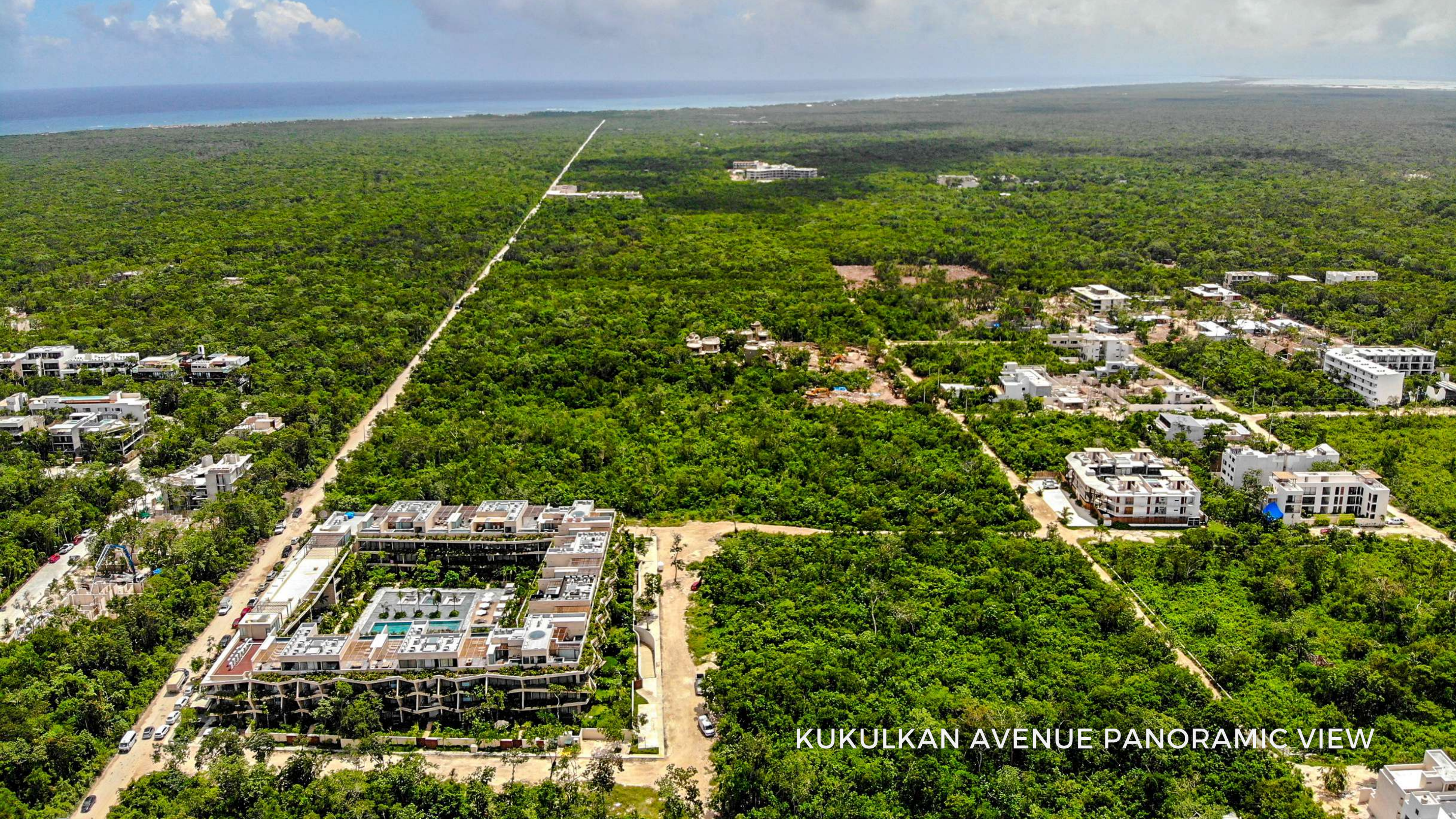
KUKULKAN AVENUE PANORAMIC VIEW